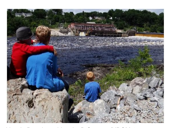
Veazie Dam breaching 1

NRCM is a leader in advocating for policies to reduce the threat of climate change and promote renewable energy. The organization is working with Administration officials, scientists and technical experts, legislators, state agencies, community leaders, state and national environmental organizations, and many other allies to build momentum for deep reductions in greenhouse gas emissions and a rapid transition to a clean energy grid that powers Maine's businesses, homes, and transportation and heating systems.