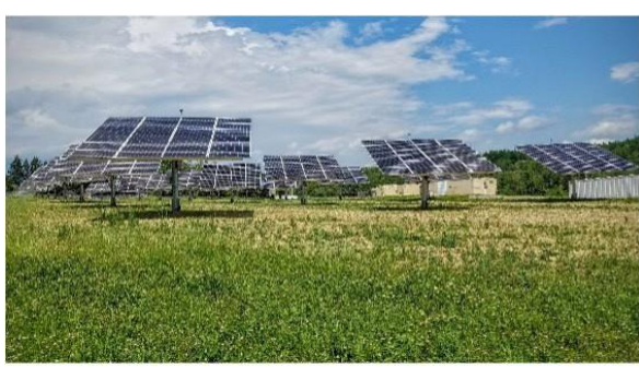
Solar panels in Aroostook County

NRCM's Sustainable Maine program takes a practical, collaborative approach to addressing environmental problems faced by Maine people, businesses, and communities, particularly in demonstrating how to better prevent and manage waste. NRCM seeks to achieve systemic changes in policies and practices at the local and state levels to reduce the environmental impacts of ordinary daily living. The organization has helped achieve many first-in-the-nation policies to reduce